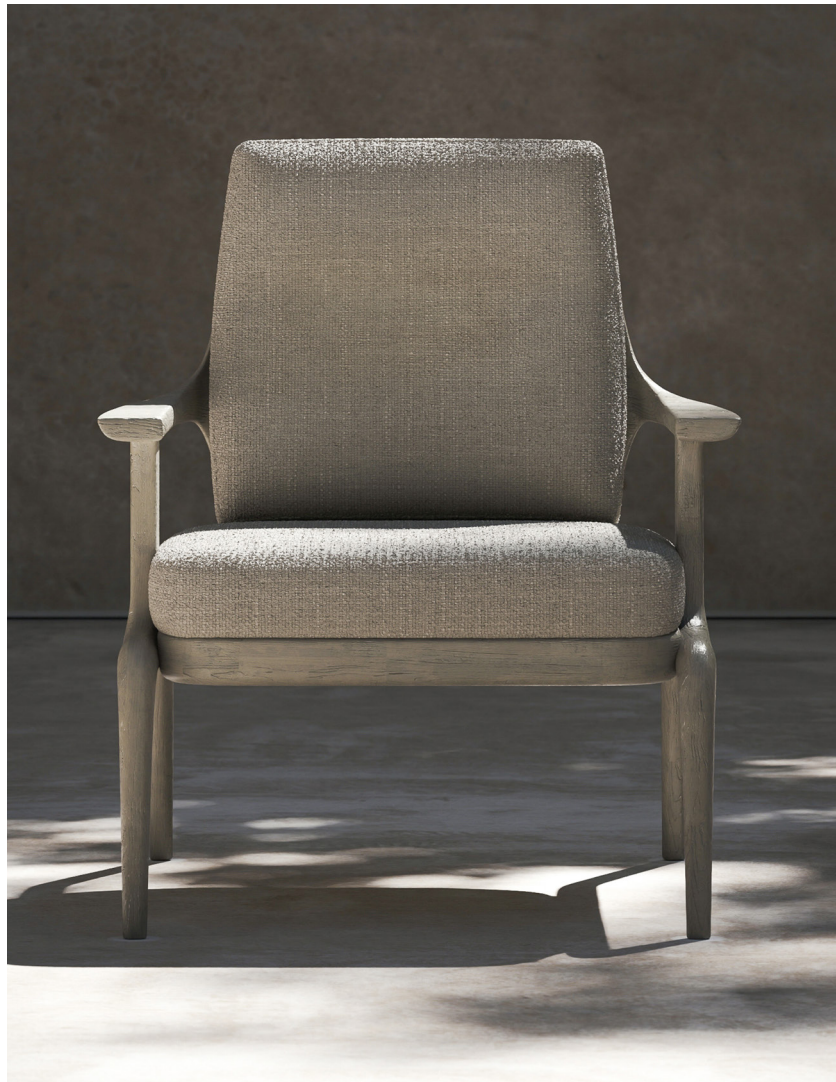
ARMCHAIR ADAM COURT