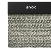
LOP R015 140