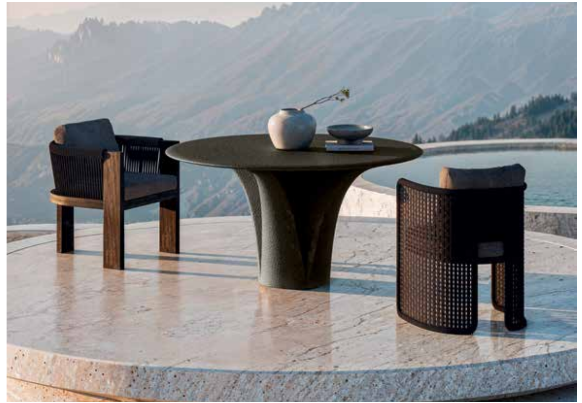
Savio-noche Round Dining Table