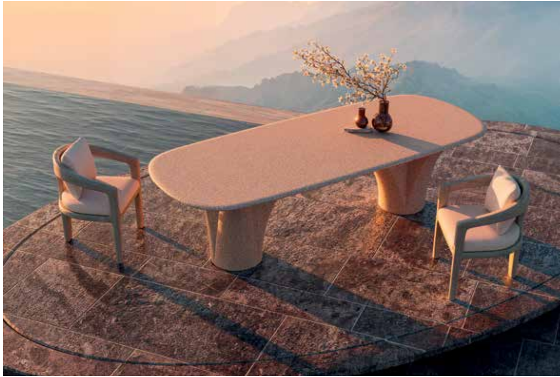
Savio-ash Dining Table