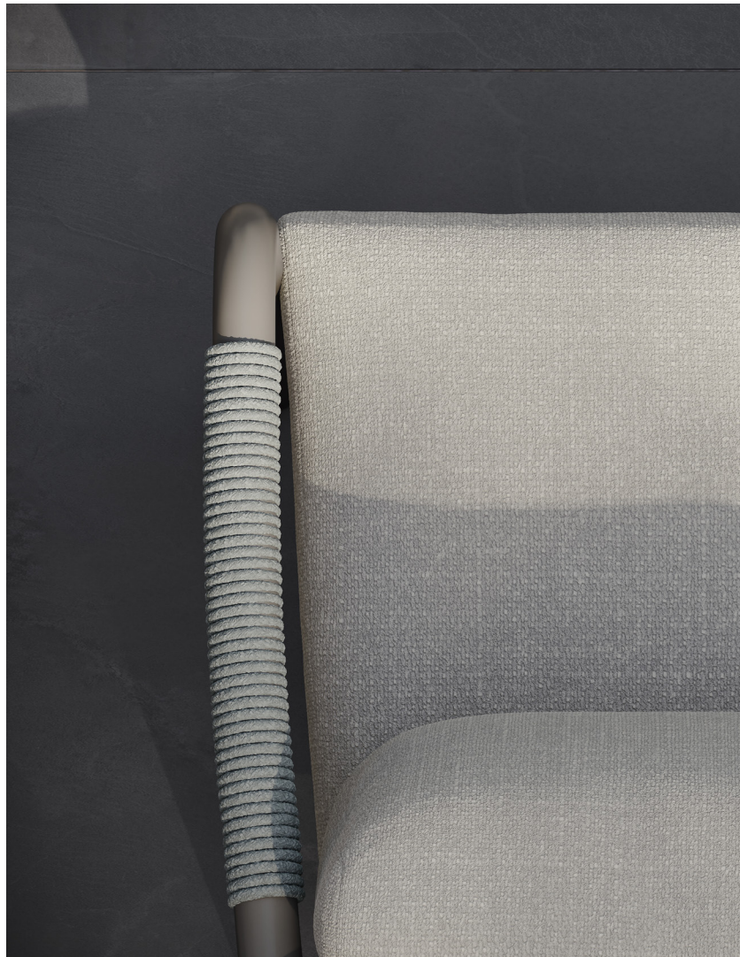
ARMCHAIR DESIGNED BY LUALDI MERALDI STUDIO