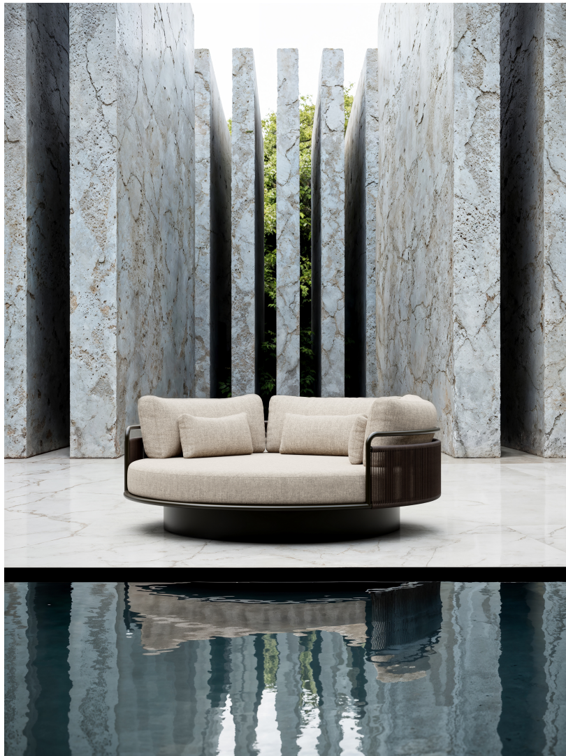
3 SEATER SOFA JUNPEI & IORI TAMAKI