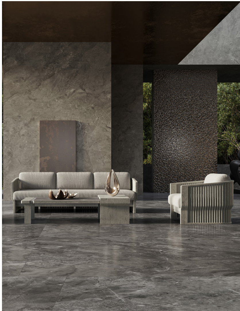
2 SEATER SOFA BY JUNPEI & IORI TAMAKI