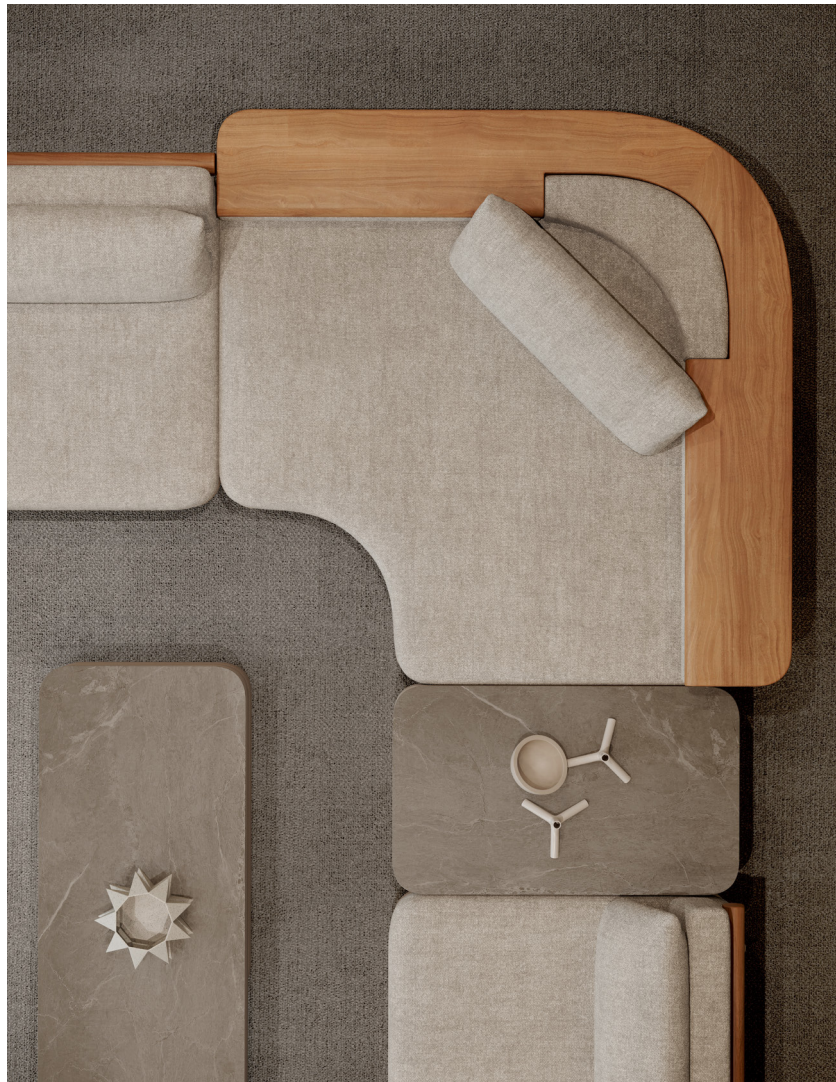
1 SEATER CENTRAL MODULE STUDIO ROTOLO